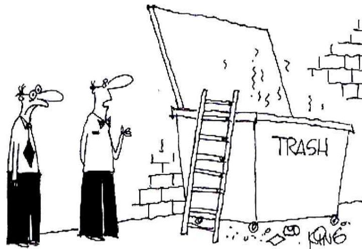
"The smoking section, sir. Enjoy."